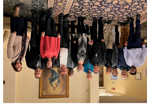
CBF member institutions worldwide

The regional and subregional coordinators have the task of promoting biblical pastoral ministry in their own regions and of coordinating it with the support of the General Secretariat. All the coordinators work on a voluntary basis.