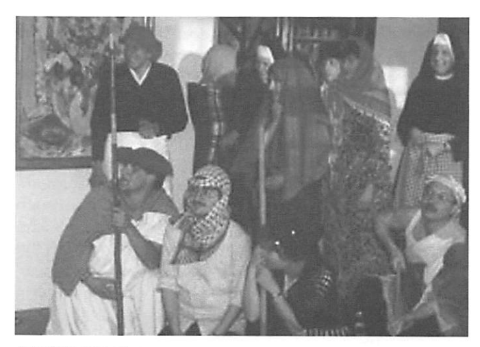
A text comes alive

The goal of bibliodramatic biblical exegesis: God's present communication with human beings becomes something tangible through the biblical text and through integrated interaction in the group. Based on the individual's present life (and faith) text, points of contact are sought in the text and can then be pursued in the dialogical acting process with the group. The trainer offers the individual the space for doing this and encourages him/her to stay on track, to understand what is being experienced in the group and helps him/her to incorporate it into the interpretive horizon of his/her life."