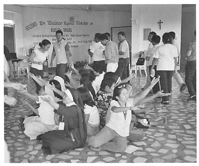
Bibliodrama involves ever more people in the Philippines

The time before the Eucharist was given to private reflection. We suggested that they made use of either an empty chair or an Egli figure in order to dialogue with "the other me", the dark side within oneself. Some approached a confessor for the sacrament of reconciliation.