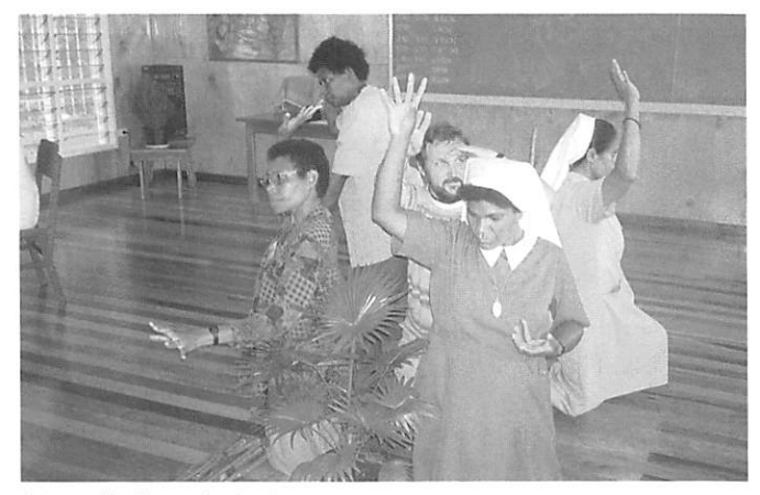
Internalization of a text

through group interaction. At the same time the background of the Scripture text becomes more transparent. This multidimensional activity (process) helps the participants to discover and experience the spiritual power of biblical wisdom: it also helps to dissolve blocks of a distorted faith tradition, e.g. false images of God. This leads to a creative process in which the participants experience inner change, allowing new life to emerge. The individual feels encouraged to listen to the Word of God in his/her everyday life, and to live hereafter accordingly, even if these new insights lead to a change in the direction his/her life was previously taking.