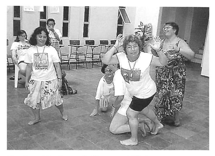
The story of the Canaanite Woman as bibliodrama

our own reality and each person chose two contrasting words and wrote down his or her associations with their respective personal and social reality. This was then expressed in a gesture and in a short sentence. After this we formed two groups which were to develop terms of expression for the concluding presentation.