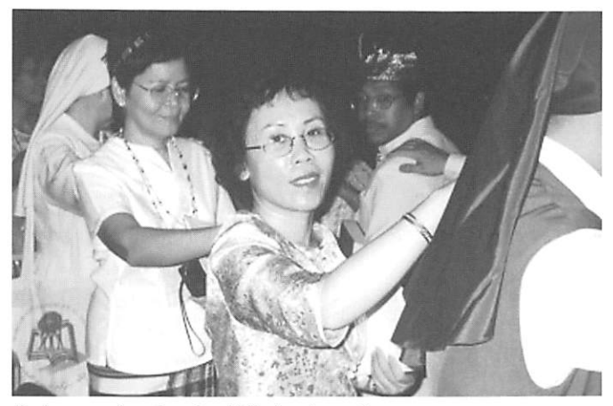
Delegates dancing the "Pilgrim dance"

ing the Word of God can deepen one's understanding of the Bible as the Book of Life – the book of movements.