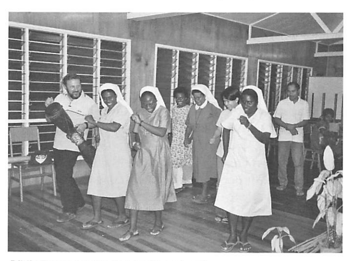
Bibliodrama connects people and cultures

The international team between the continents has also won considerable courage and strength through this journey with the Word of God. Team spirit and team work require a deeper source in order for a project like this to succeed. Bibliodrama is but one path to this source that never runs dry, the Holy Scripture.