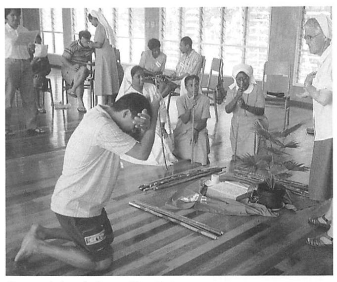
At a workshop in Papua New Guinea

Stimulating spontaneity and creativity so that the participants can experience their own religiosity and can express this religiosity on a personal level and in contact with others.