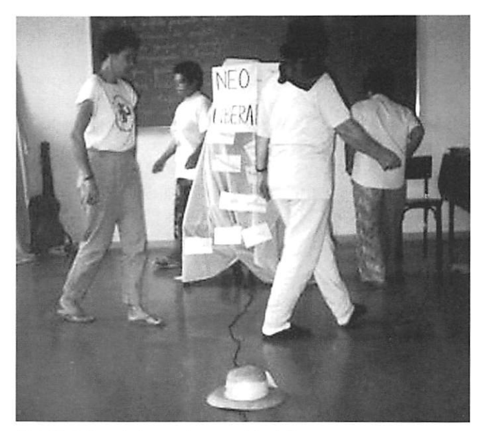
Neo-liberalism brings misery and isolation

According to our interests we split into three subgroups. All three sub-groups followed the same pattern which I will now describe, using as an example our group which dealt with "neo-liberalism".