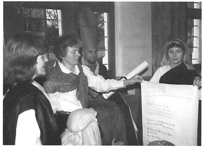
In dialogue with the text

For me a text that I have worked on and lived through with a group in bibliodrama is far more intensely present and vitally accessible as experienced truth than is one that has merely been subjected to scientific analysis. Its message is literally more penetrating than it could possibly be through mental labor alone.